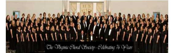
An IRS 501 (c) (3) non-profit organization